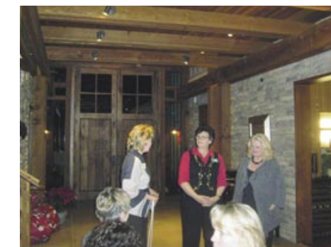
WCR was proud to present both YWCA and Shelter Outreach Plus with $3,800 checks as well as 30 new jackets